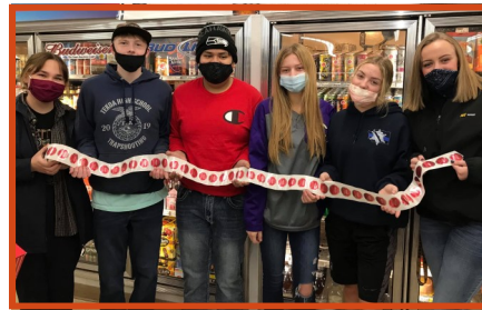
Coalition Student Representatives Fall 2020 Sticker Shock

Project Sticker Shock aims to prevent underage youth from obtaining alcohol from adults 21 or older or using a fake ID to purchase alcohol by raising community awareness about Washington laws.