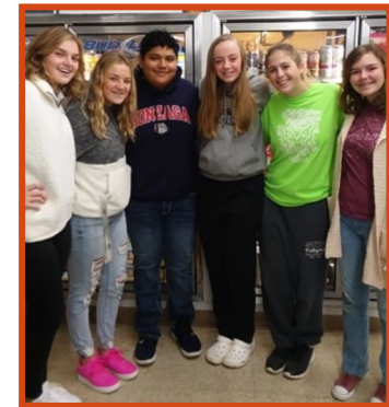
Coalition Student Representatives Fall 2019 Sticker Shock

In Washington, these offenses are gross-misdemeanors and are punishable by fines of up to $5,000 and up to one year in jail.