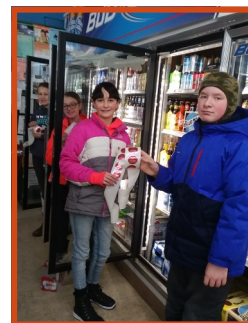
Coalition student volunteers Winter 2019 Sticker Shock

This program encourages partnership between community organizations, youth, retail establishments, law enforcement, media, and other community members.