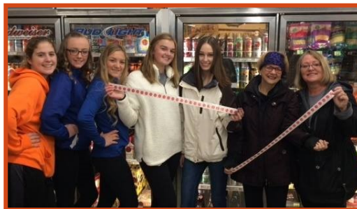
Coalition Representatives Fall 2018 Sticker Shock

According to the 2018 National Survey on Drug Use and Health, the majority of underage drinkers (72%) did not pay for alcohol the last time they drank and the most common source of alcohol (23%) for these youth was an unrelated person aged 21 or older.