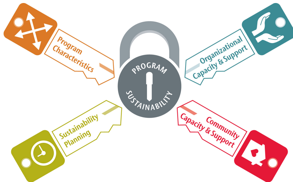
Figure 1. The four key ingredients for successful program sustainability.