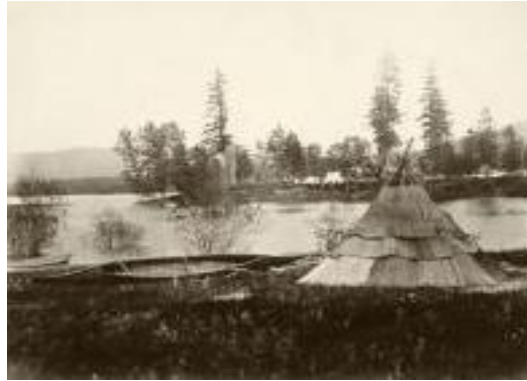
Teepee and Canoe - Pend Oreille River, 1860